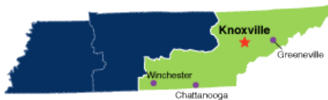
Image 2: Map of the United States District Courts of Tennessee West, Middle, and East (colored in green)